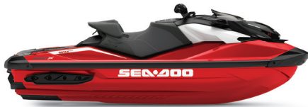
NEW Fiery Red Premium