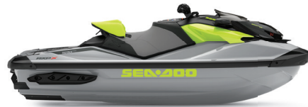
NEW Ice Metal and Manta Green